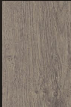
dark brown 8G-148-A009 + 2504/12