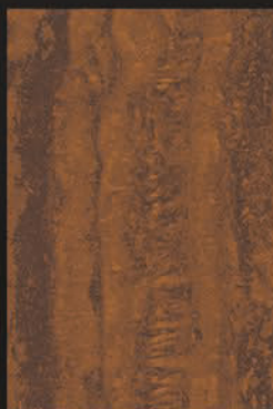
dark brown, travertine DS-0729S + 5015/08