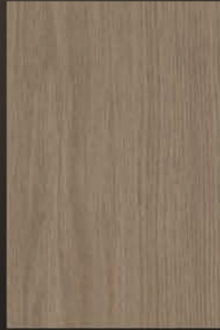
grey 9G-148-A009 + 2507/01