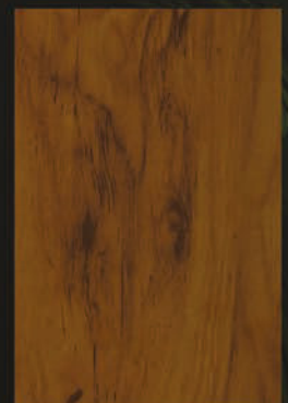
dark brown, ivory DS 750 + 2901/06