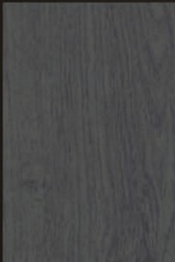
grey 8G-174-A005 + 2504/10