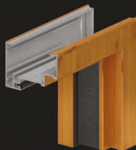
Double rebated door frame