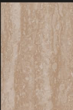
grey, travertine DS-0408S + 5015/05