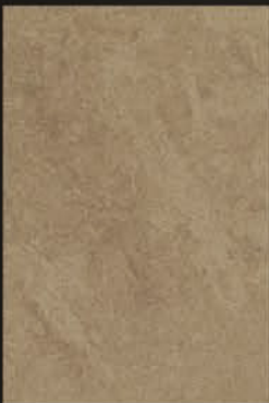
light brown, stone 8G-148-A009 + 5024/06