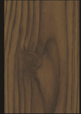
dark brown, pine tree DS 775 + 2112/03