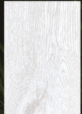
white, oak DS-0704MS + 2308/24