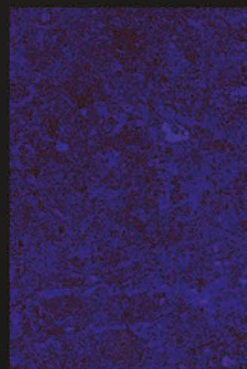
blue, concrete Glass-004 + 5026/02