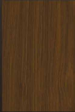
dark brown DS 775 + 2507/18