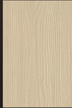
beige, pine tree DS 752 + 2117/23