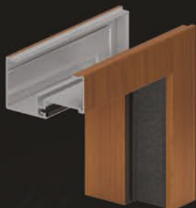
Internal (rectangular) frame