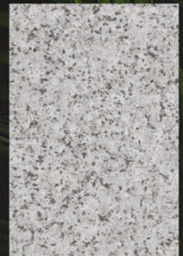
grey, granite Mirror-058S + 5014/01