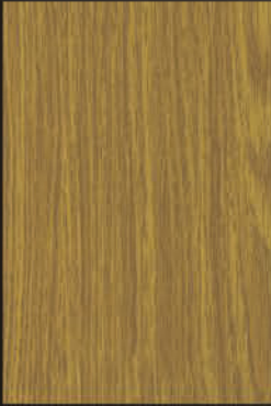
light brown DS 716 + 2507/01