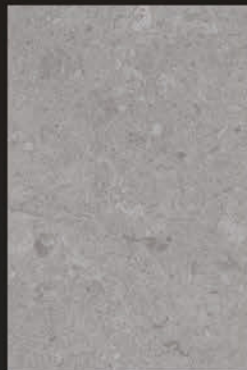
grey, concrete 9C-016-A001 + 5026/04