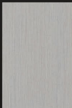
grey, steel MirrorL-183S + 6053/01