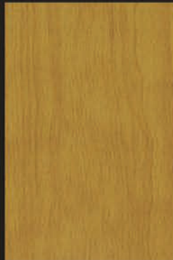
light brown, beech DS 716 + 1602/01