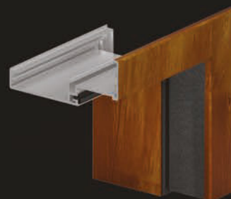
Corner frame SK